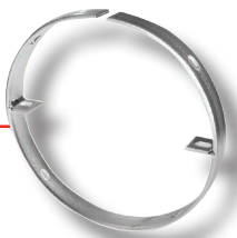
Full Guard Bracket Mounting Rings