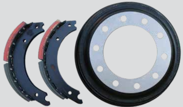
American Drive Axle Centrifuse 16 ½ x 7" TDBKDRV10