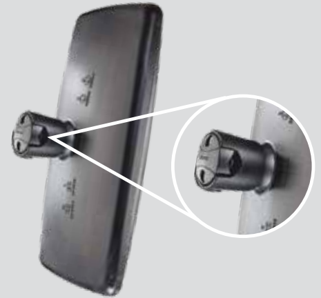
Ashtree Mirrors Wide Range Available ATM714CE