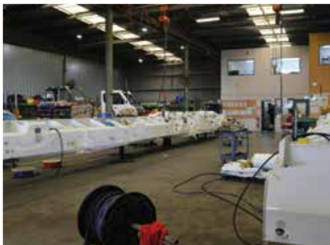
Quad decks on their backs being assembled with axles, suspensions, controls and hydraulics.