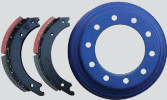
American Front Axle Centrifuse 16 ½ x 5" TDBKC4720