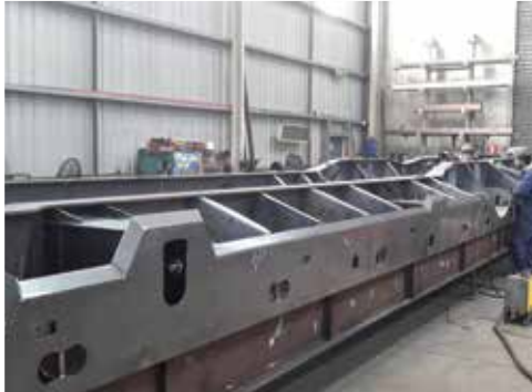
Quad widening decks fabrication completed.