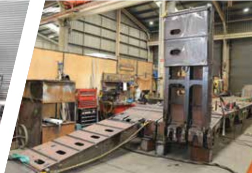
Trial fit of double fold ramps to Axle widening Quad.