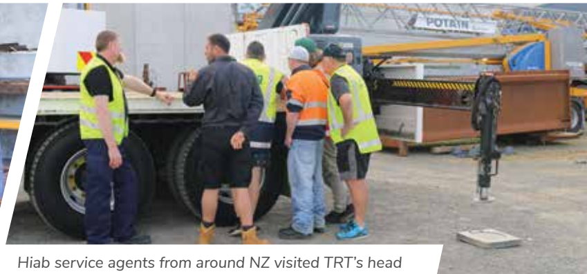
Hiab service agents from around NZ visited TRT's head office in Hamilton for a week long technical training course to refresh and update their skills and knowledge.