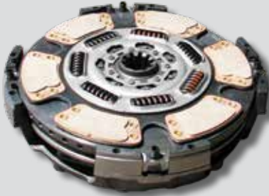
Clutch Eaton Roadranger 15.5" x 2" 1750lb SP208935271