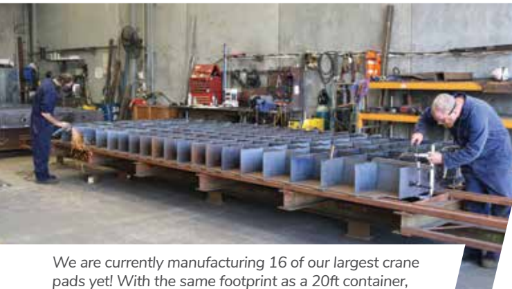
We are currently manufacturing 16 of our largest crane pads yet! With the same footprint as a 20ft container, these crane pads have the centred capacity of a 250t load.