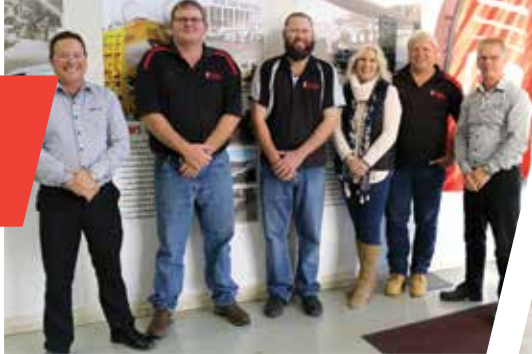
T&C Excavations team visit NZ head office in Hamilton.