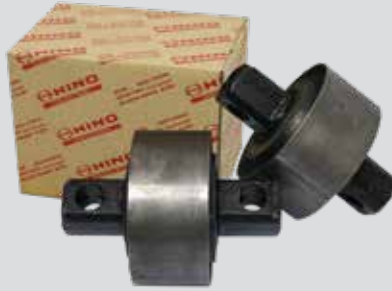
Genuine Hino Torque Rod Bushes HIS40JJ-E0090KIT