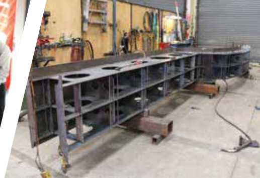
Gooseneck during fabrication.