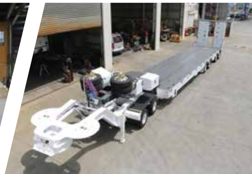
Trailer completed. Trailer closed at 2.5m, Dolly attached.