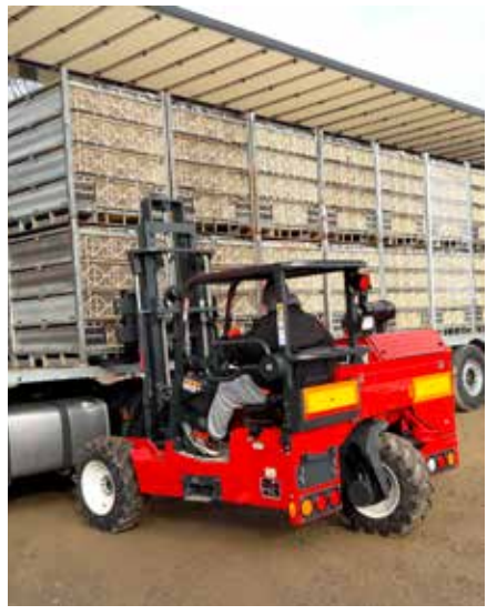
▼ Discover more moffett.hiab.com