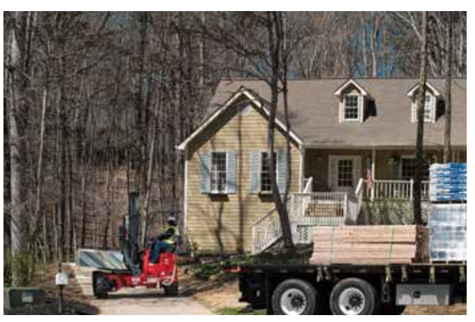
▼ The products shown here in this brochure are part of Hiab's global product selection. Deviations of the selection due to geographical location may occur. Please contact your local Hiab dealer for further details on available models, accessories and options.

The M8 NX is incredibly powerful, yet compact enough to be carried on almost any truck or trailer. It's available with a wide range of options and attachments including 4-way steering for negotiating tight access areas with long loads.