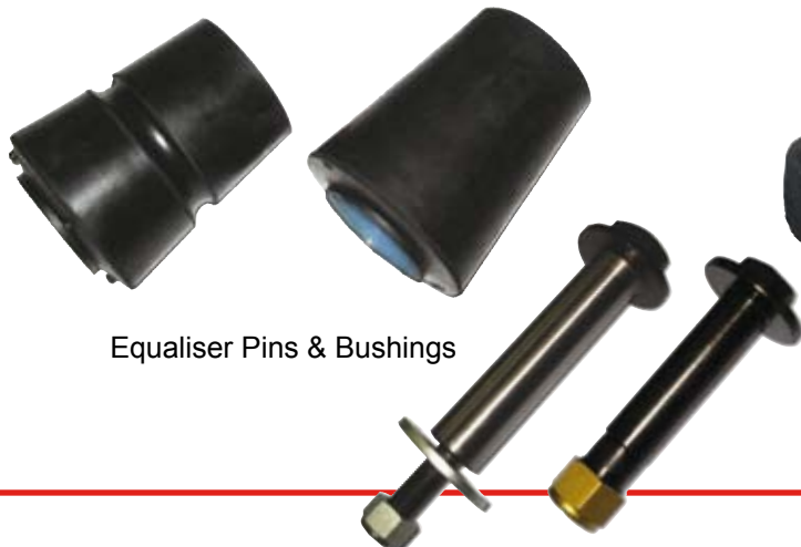
Equaliser Pins & Bushings