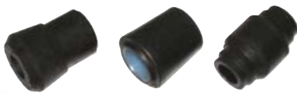
Torque Rod Arm Pins & Bushings

With a range of components too extensive to include in this publication, we cater for most mechanical suspension applications on the New Zealand market. We import directly from the OE Manufacturers and their suppliers.