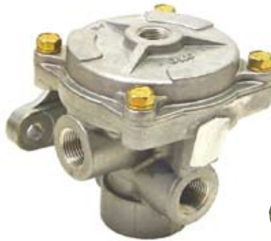
TOP CONTROL 1 DELIVERY 45184-90011 NISSAN