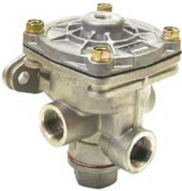
TOP CONTROL 1 DELIVERY 45184-90000 NISSAN