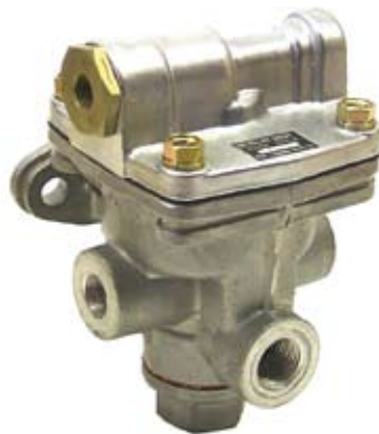
2 CONTROL 2 DELIVERY 45184-90010 NISSAN