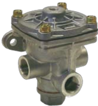
TOP CONTROL 2 DELIVERY PORTS 44540-1030 HINO